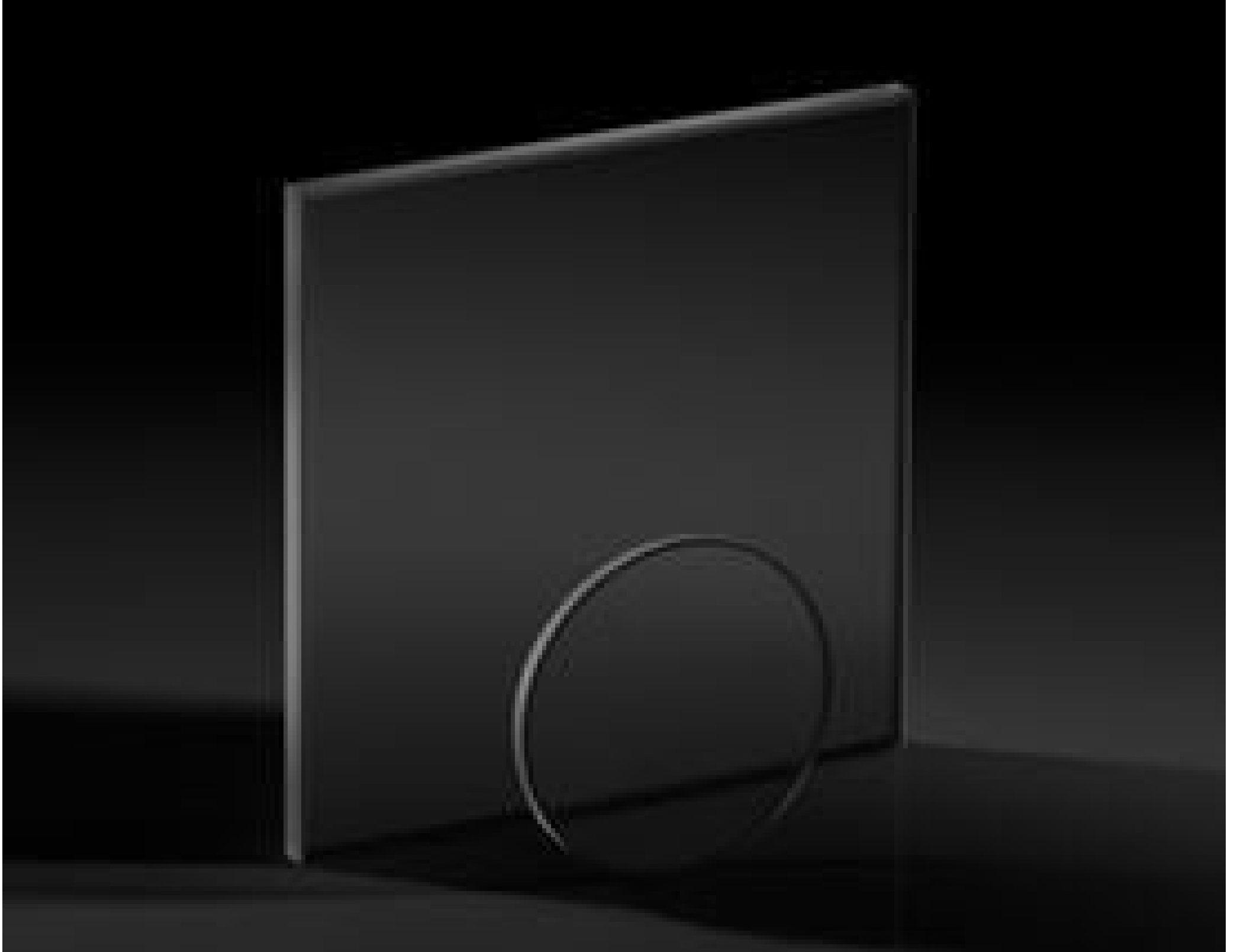
Precision Absorptive Neutral Density (ND) Filters