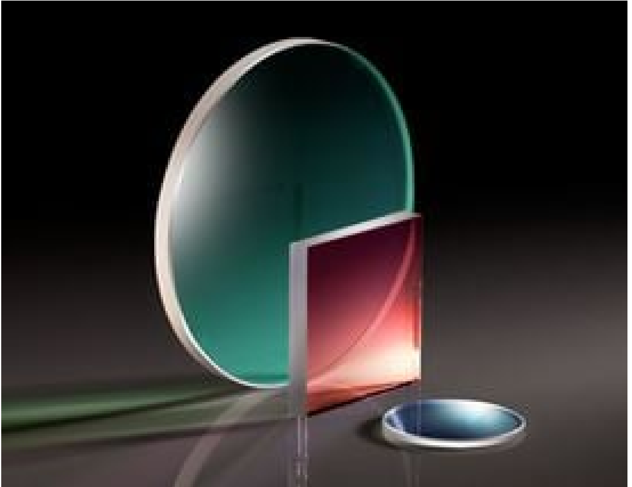
TECHSPEC High Performance Hot Mirrors