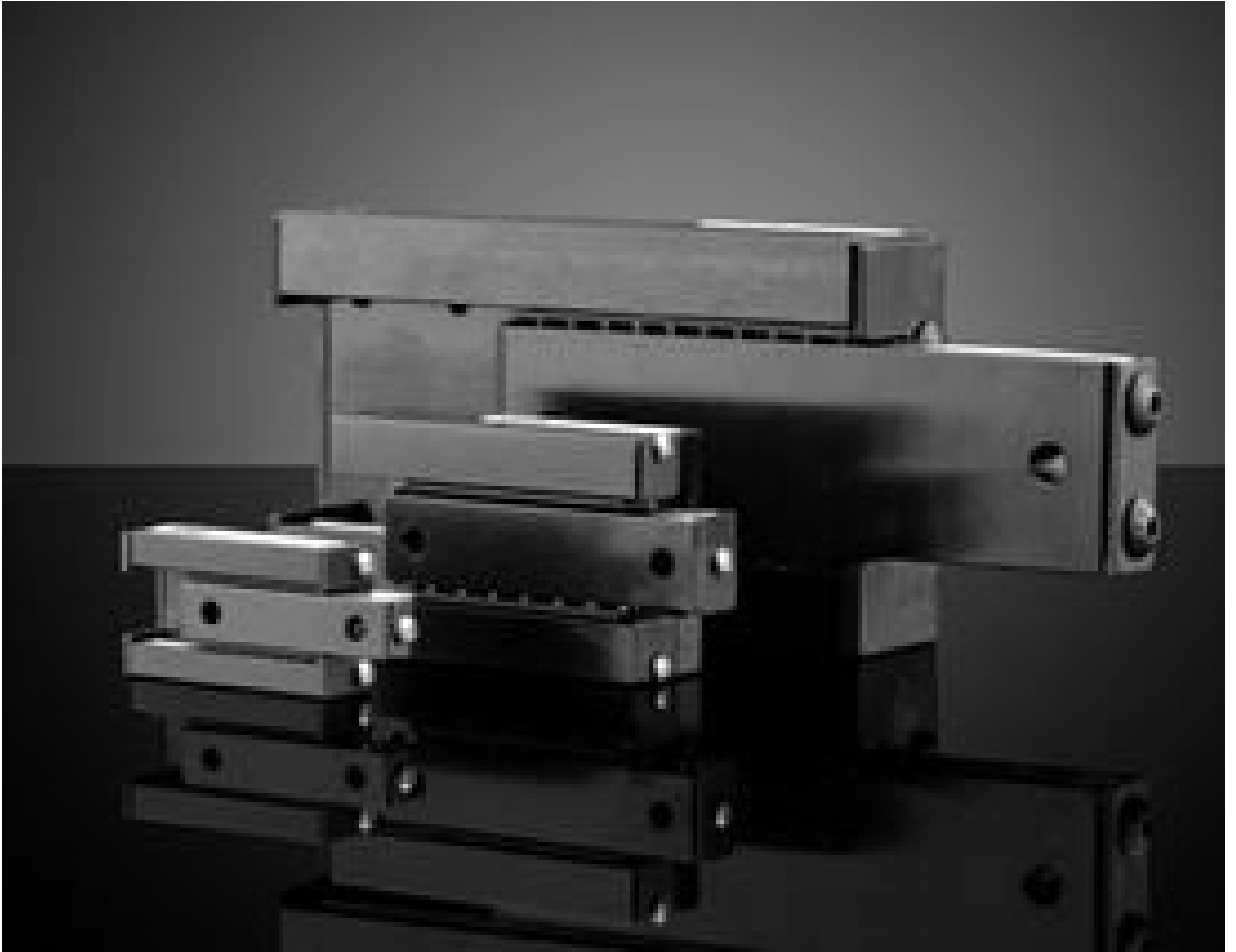
Linear Motion Ball Bearing Slides