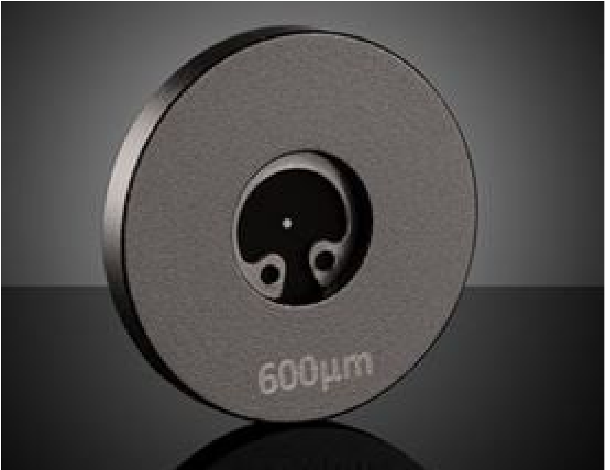
Acktar Blackened Pinholes (mounted)