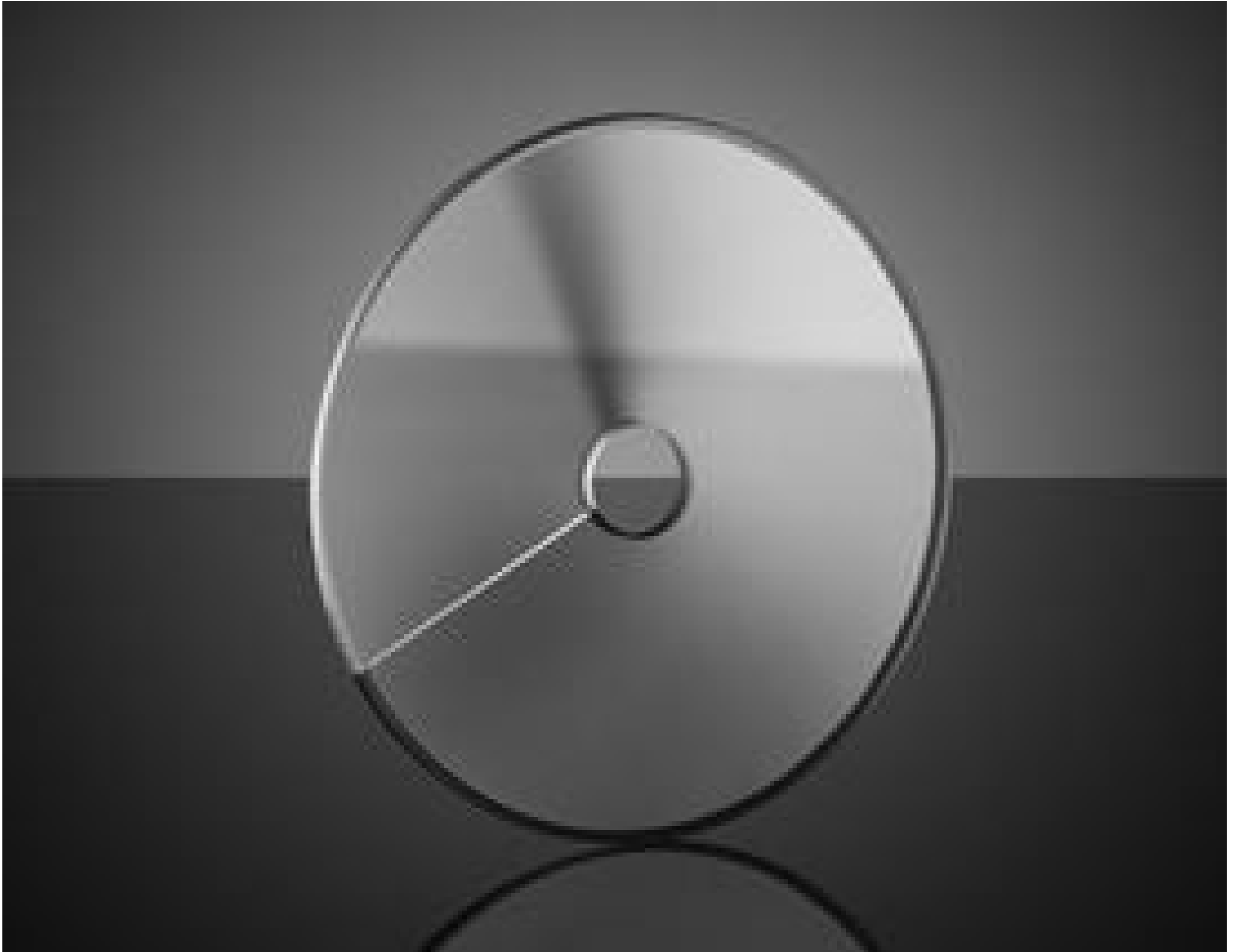
Unmounted Circular Variable Neutral Density (ND) Filters