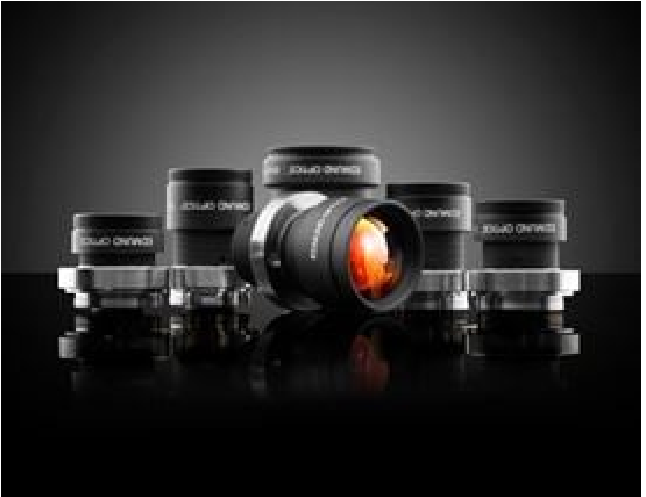
TECHSPEC® Cr Series Fixed Focal Length Lenses