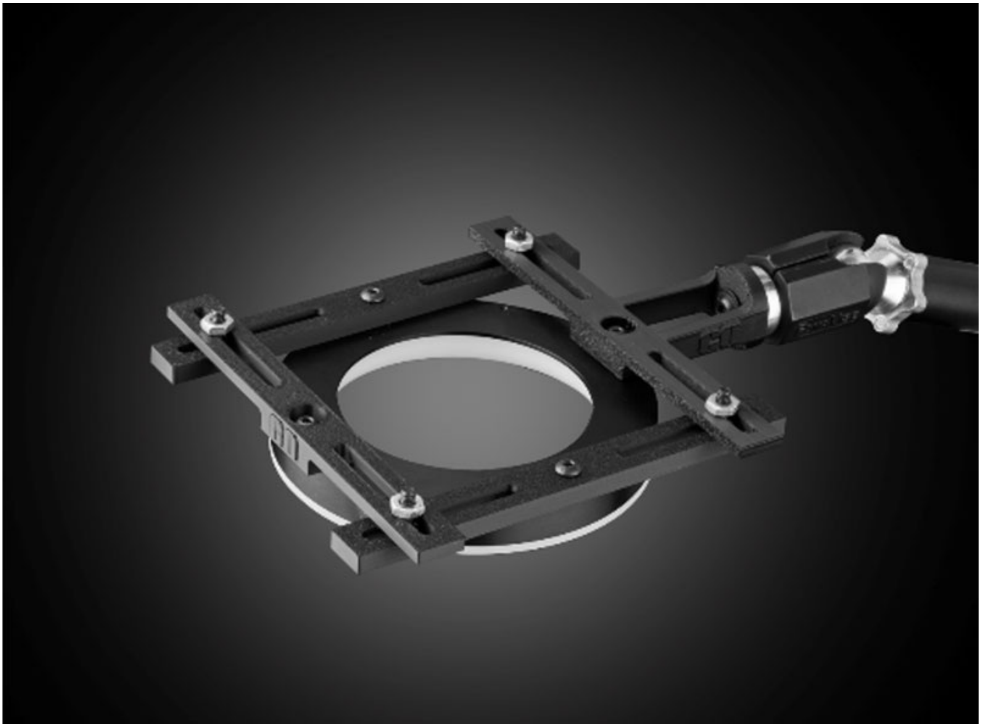
Ring Light Configuration