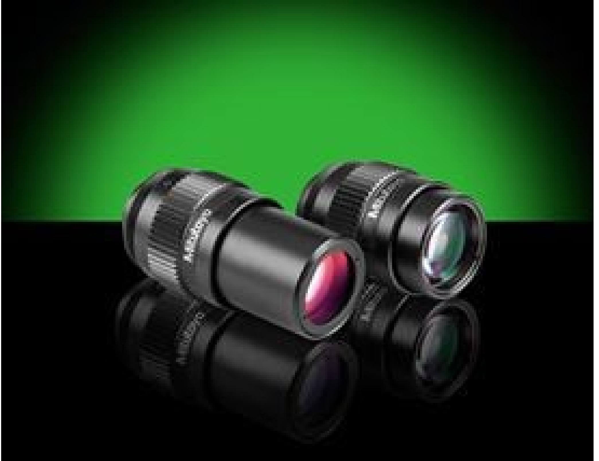
3X (#56-985) & 5X (#56-986)