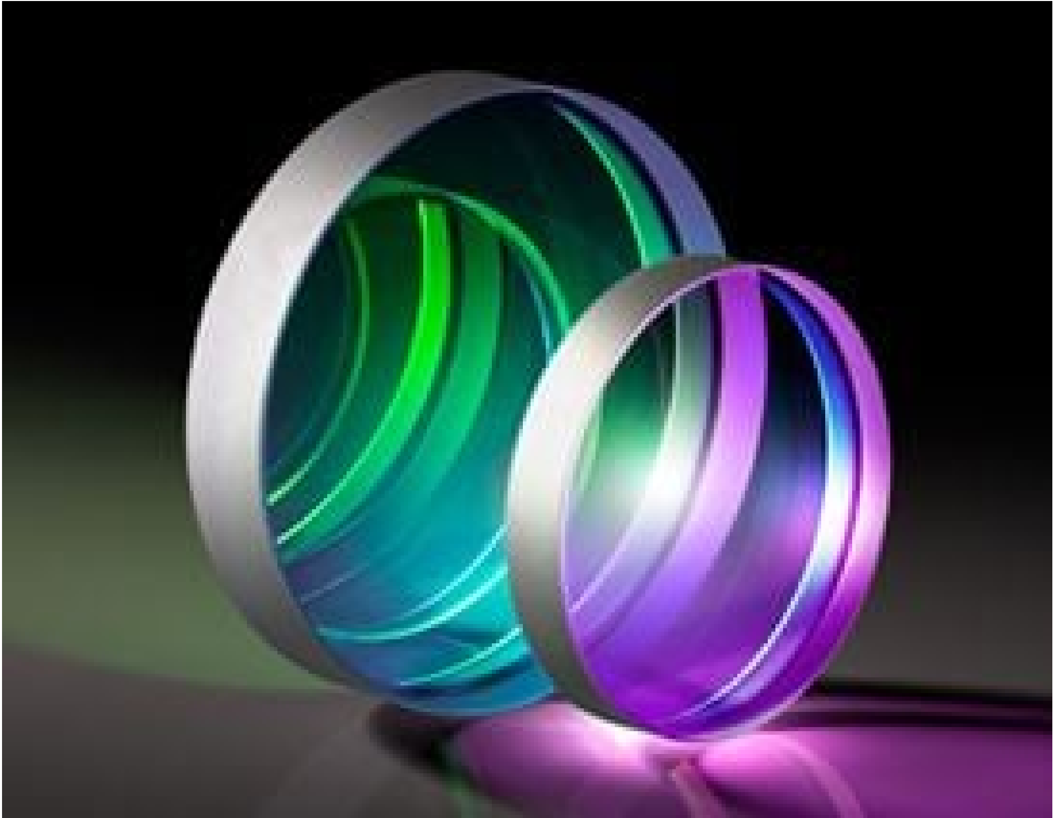
TECHSPEC® Nd:YAG Laser Output Couplers