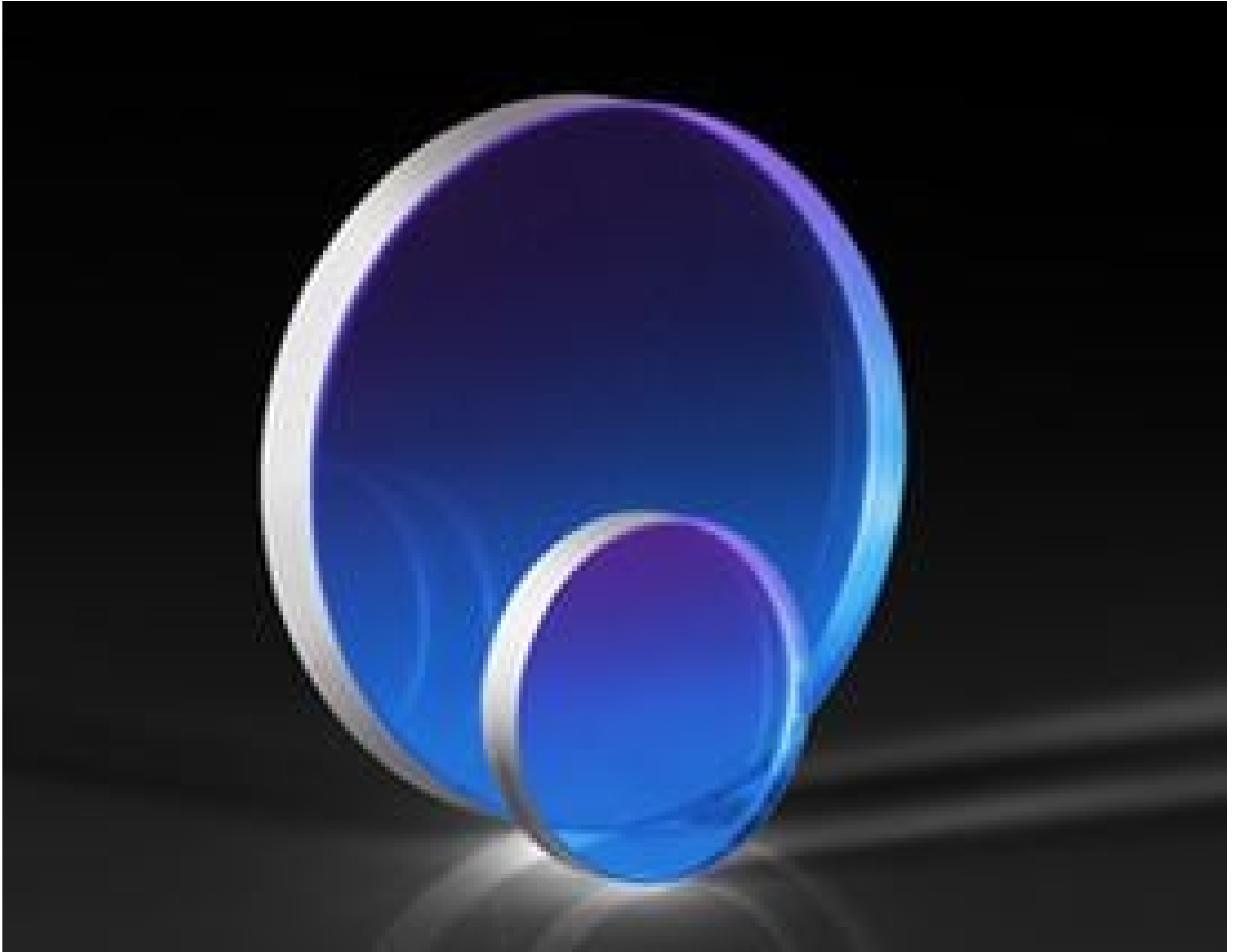
Magnesium Fluoride (MgF 2 ) Windows