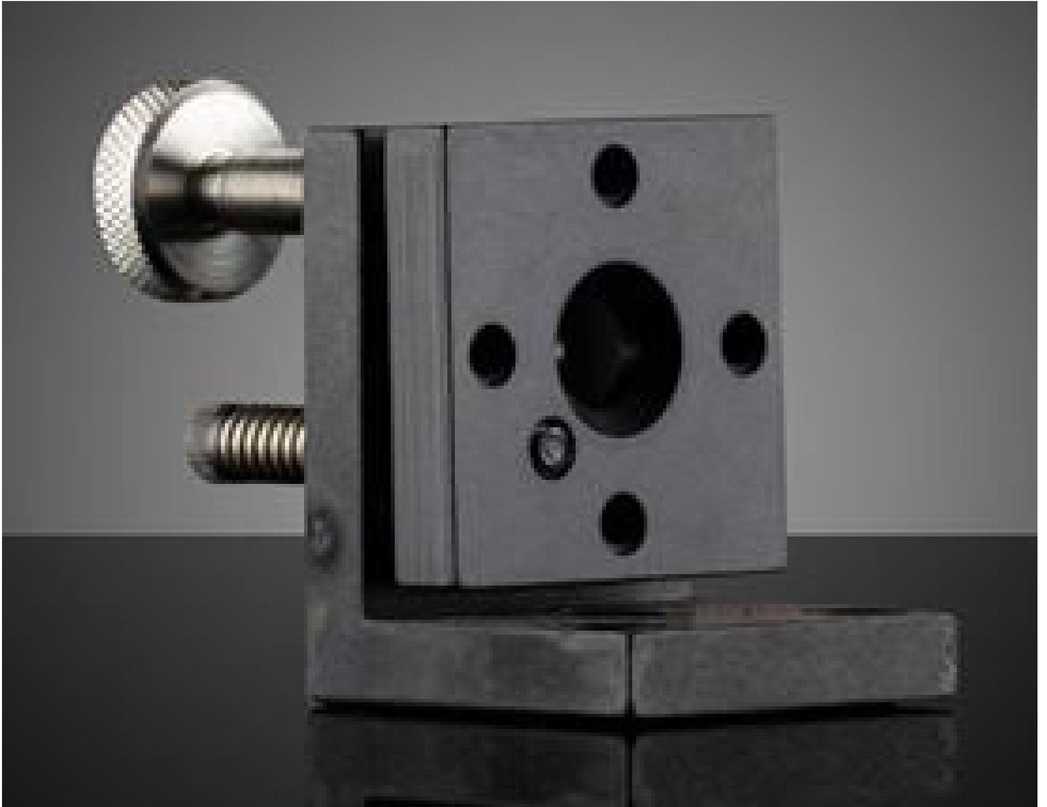
1.0" Angle Mirror Mount