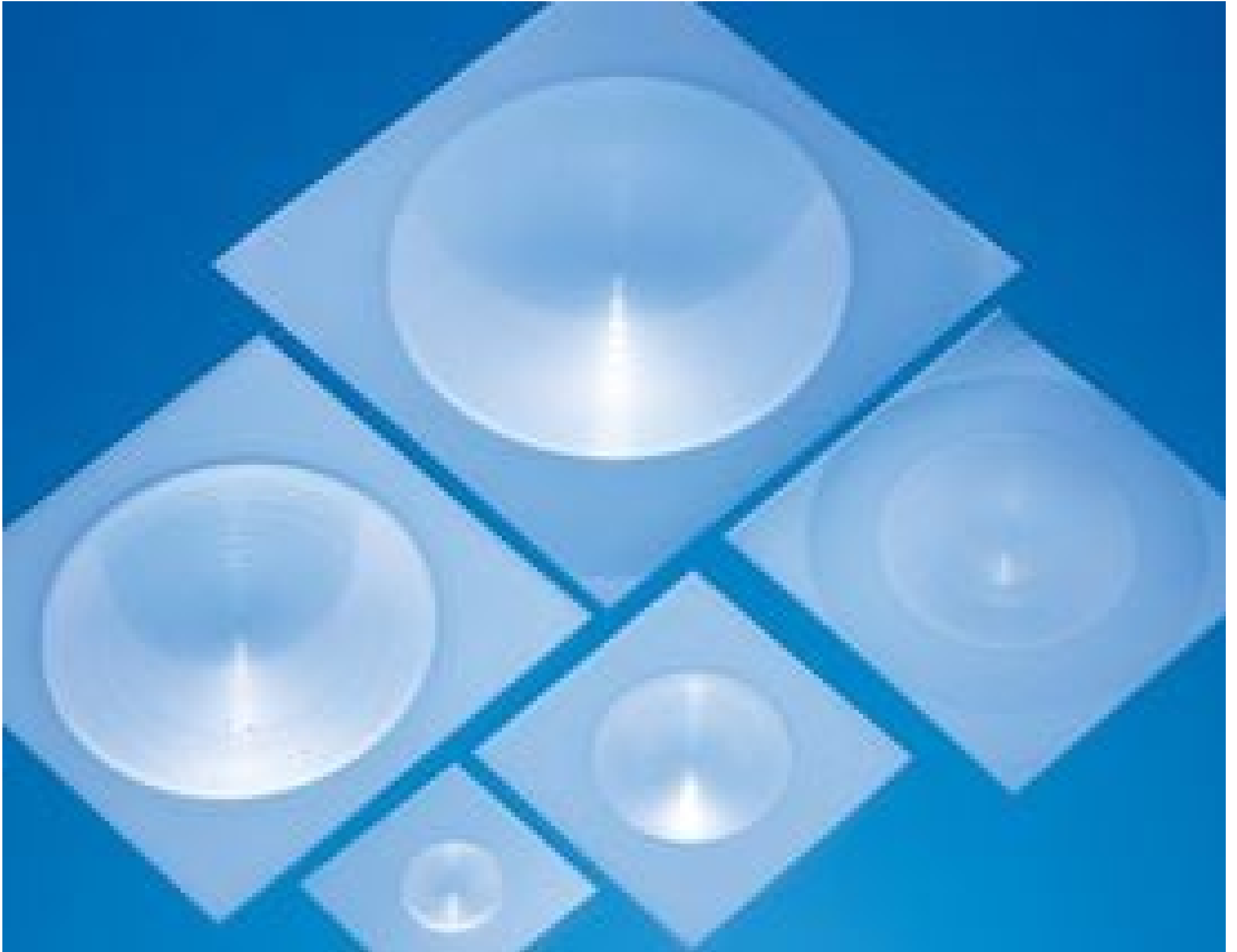
Infrared (IR) Fresnel Lenses