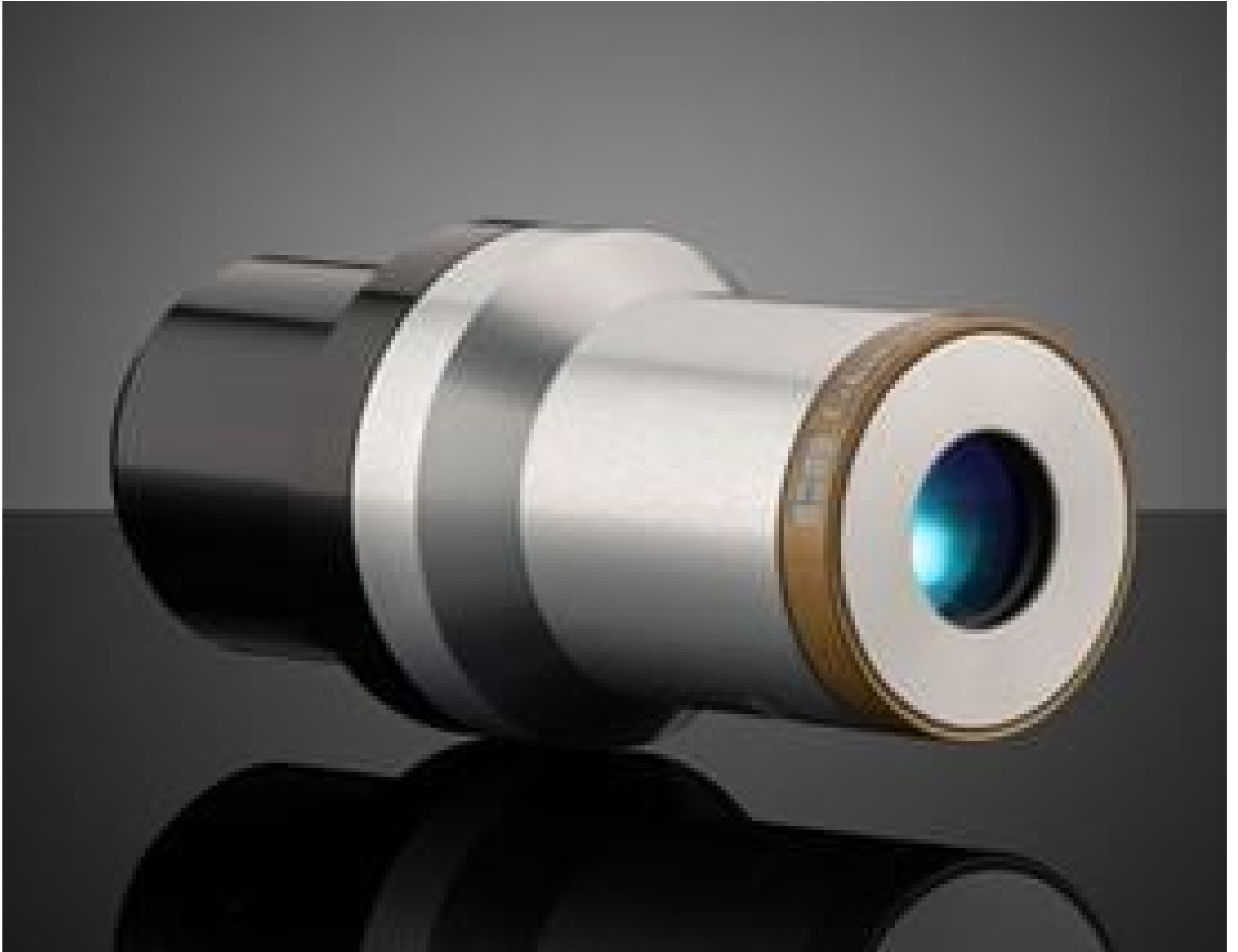
#88-354: 10XCf Objective