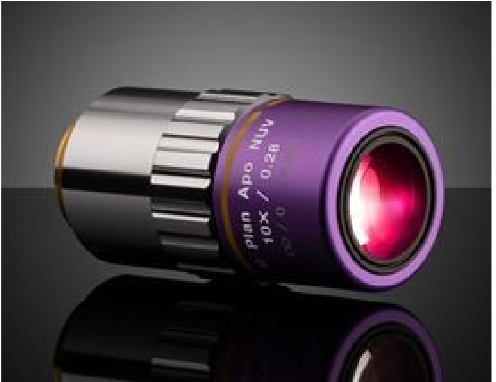
10X Mitutoyo Plan Apo NUV Infinity Corrected Objective, #86-176