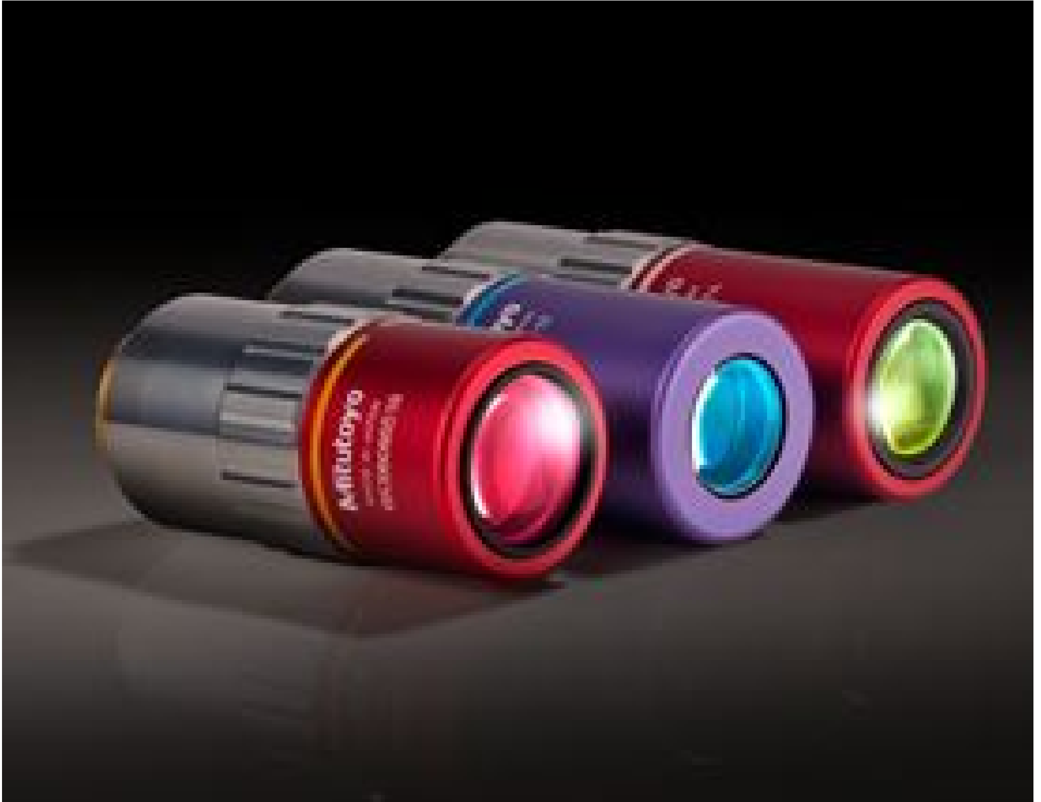
Mitutoyo NIR, NUV, and UV Infinity Corrected Objectives