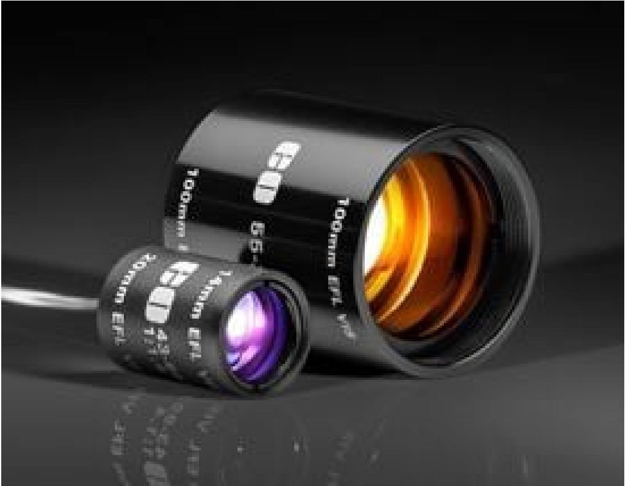
TECHSPEC Mounted Achromatic Lens Pairs