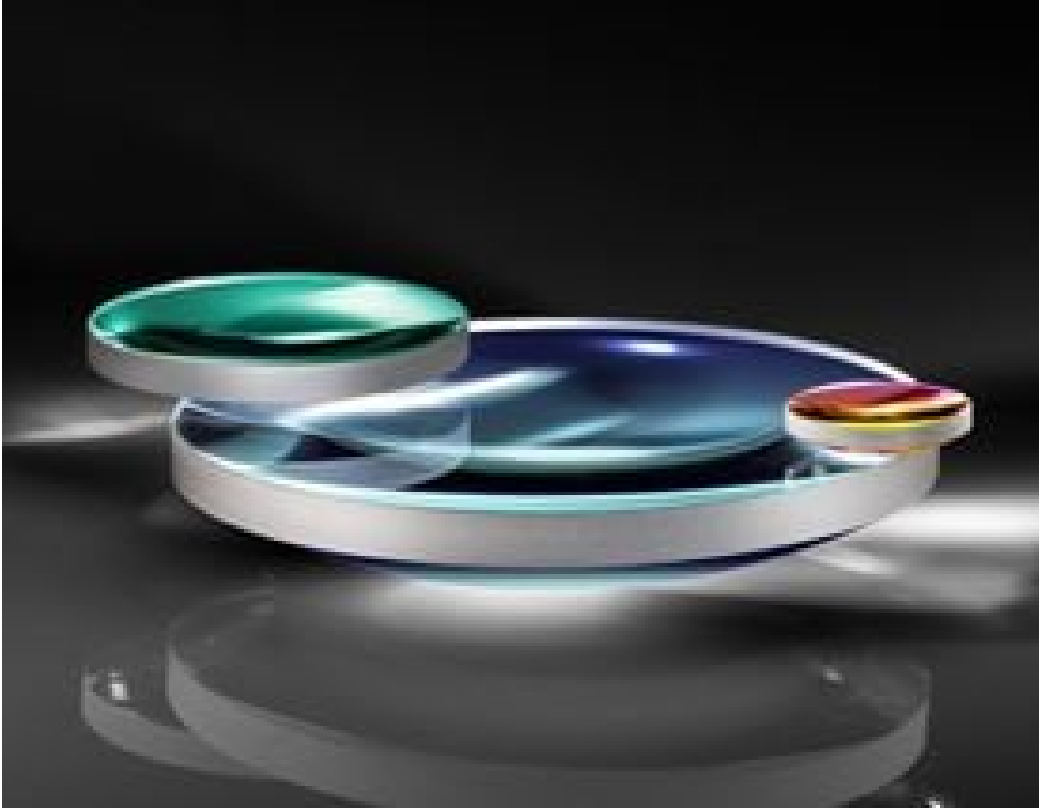
633nm Laser Line Coated Plano-Convex(PCX) Lenses