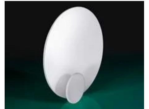
#34-471 - 12.5mm Dia. White Diffusing Glass C$42.35