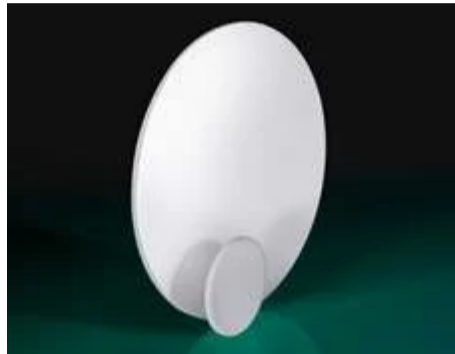
#34-476 - 50 x 50mm White Diffusing Glass C$63.35