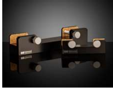
Fixed Filter Mounts