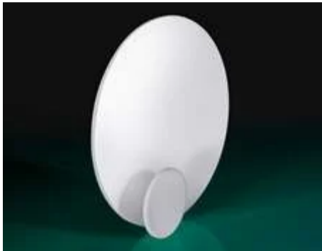
#34-472 - 12.5 x 12.5mm White Diffusing Glass C$42.35