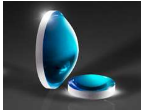
#35-040 - 12mm Dia. x 10.5mm FL, MgF 2 Molded Aspheric Condenser Lens C$66.85