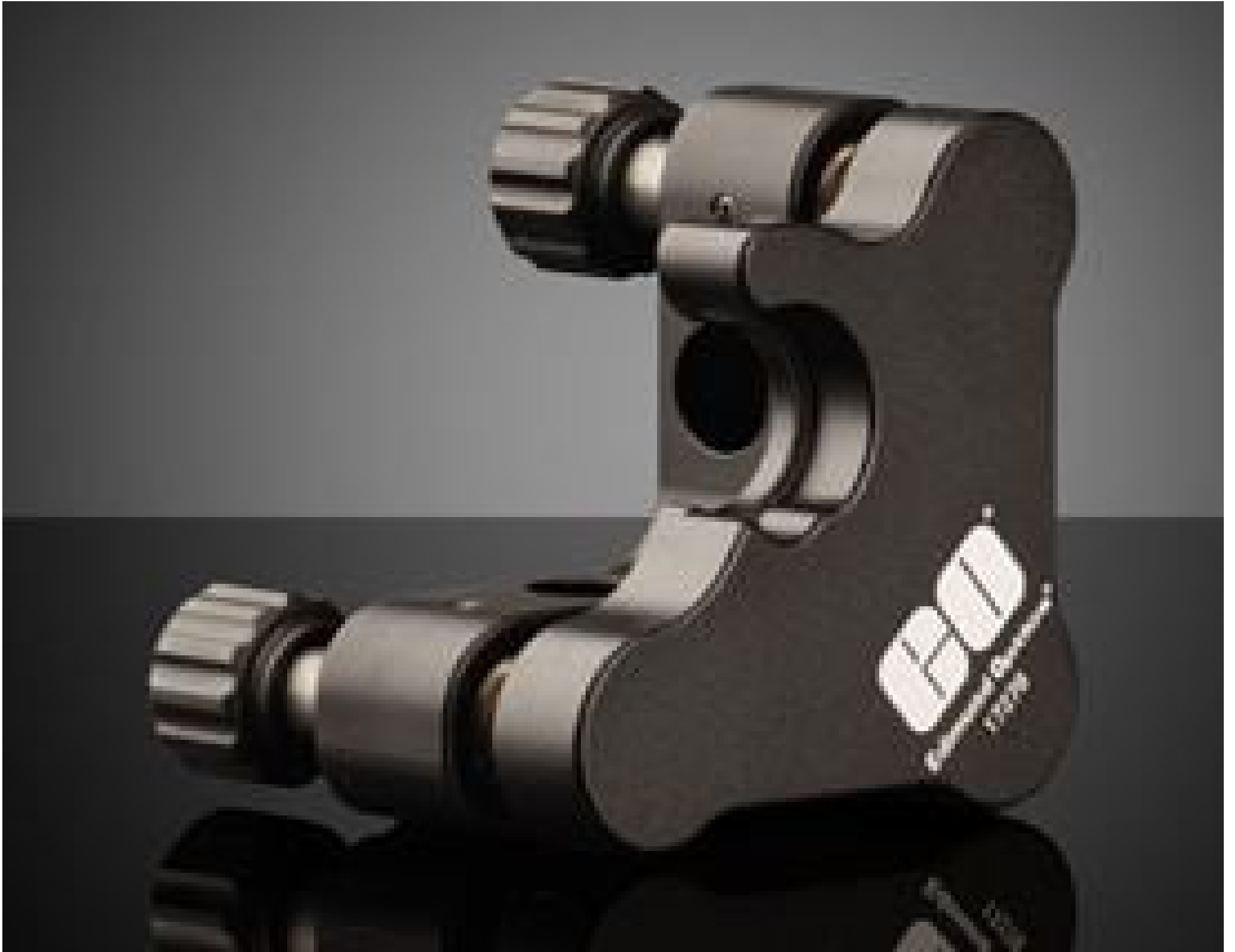
#17-278, 12.5/12.7mm Optic Dia., E-Series Clear Edge Kinematic Mount