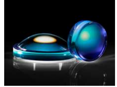
#33-426 - LightPath 354125 | 11mm Dia., 0.50 NA, BBAR (600-1050nm), Molded Aspheric Lens C$166.60