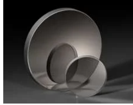
#47-530 - 1.0 OD 25mm Dia., NIR ND Filter C$176.40