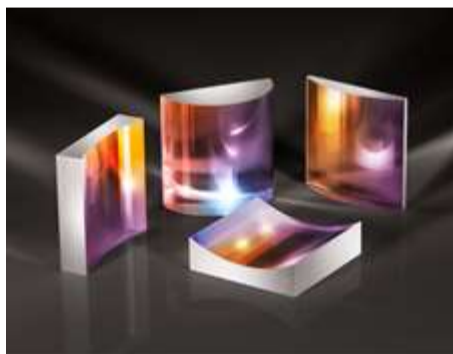
Laser Grade Broadband Cylinder Lenses