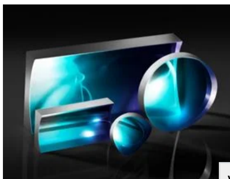
TECHSPEC® Illumination Grade PCV Cylinder Lenses