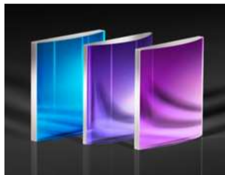
Laser Grade Laser Line Cylinder Lenses