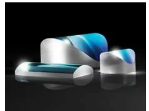
Illumination Grade PCX Cylinder Lenses