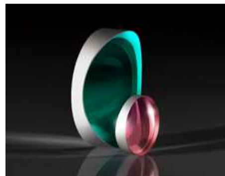
Imaging Grade PCV Cylinder Lenses