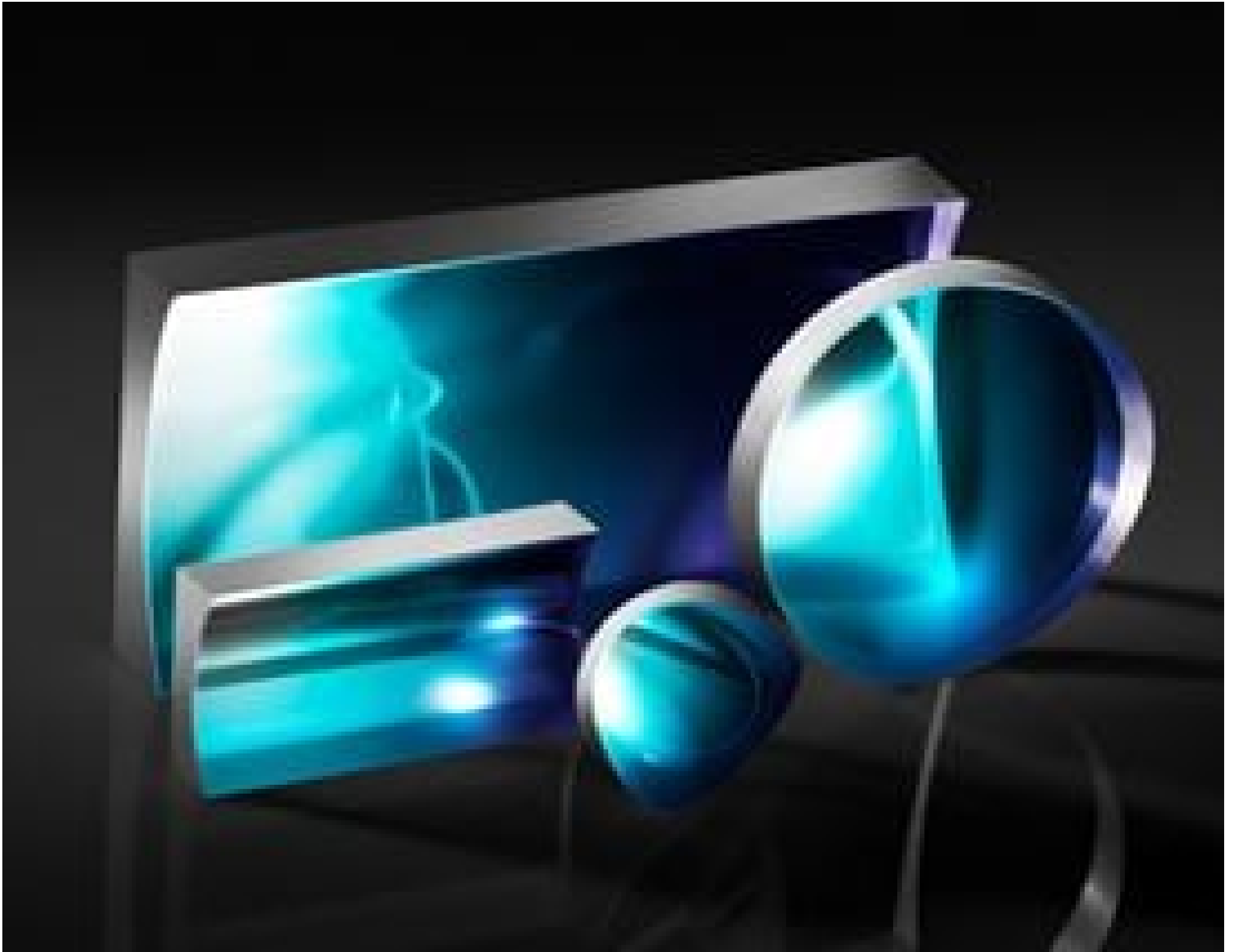
TECHSPEC® Illumination Grade PCV Cylinder Lenses