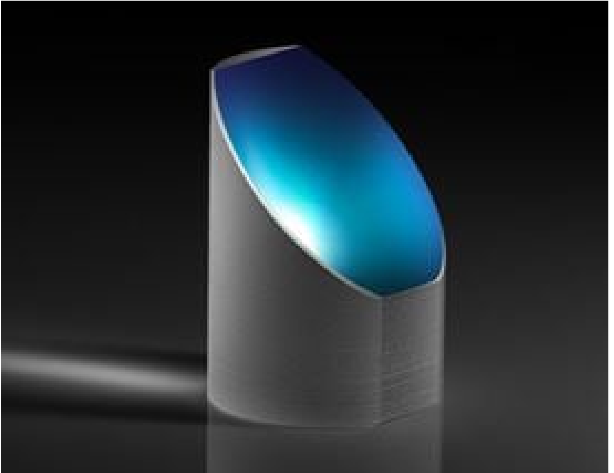
High Performance Fused Silica Off-Axis Parabolic (OAP) Mirrors