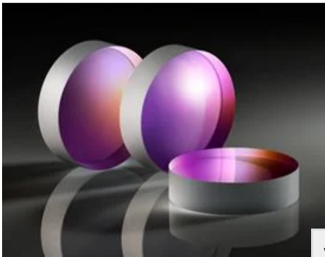
TECHSPEC Uncoated Concave Mirrors