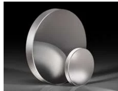
Ultrafast-Enhanced Silver Concave Laser Mirrors