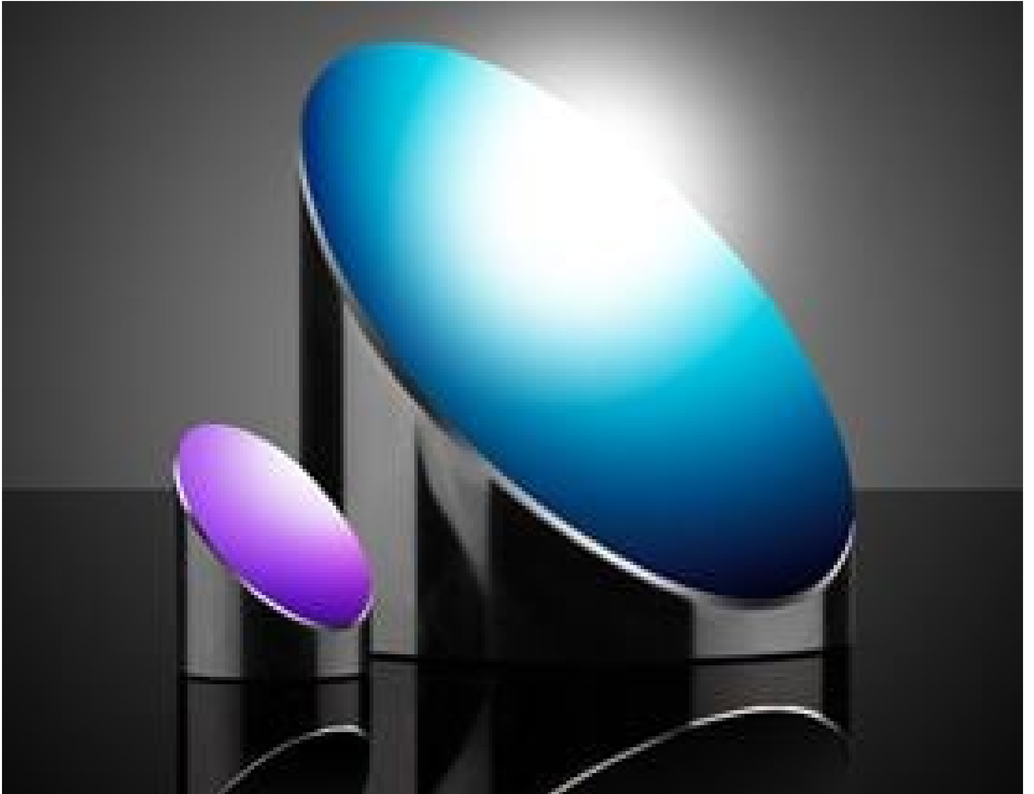
TECHSPEC® Laser Line Coated Off-Axis Parabolic (OAP) Mirrors