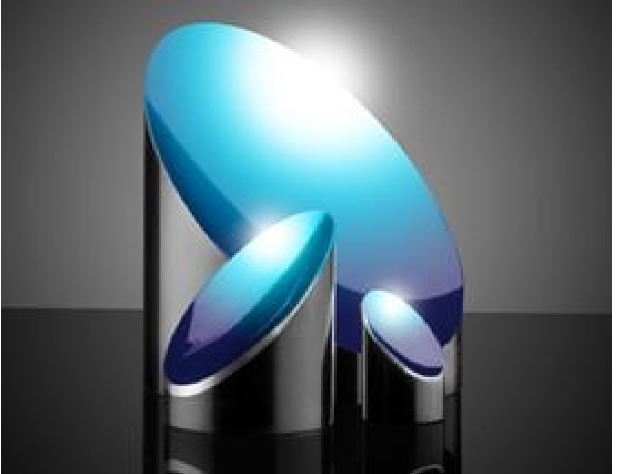
TECHSPEC® Ultrafast-Enhanced Silver Coated Off-Axis Parabolic (OAP) Mirrors