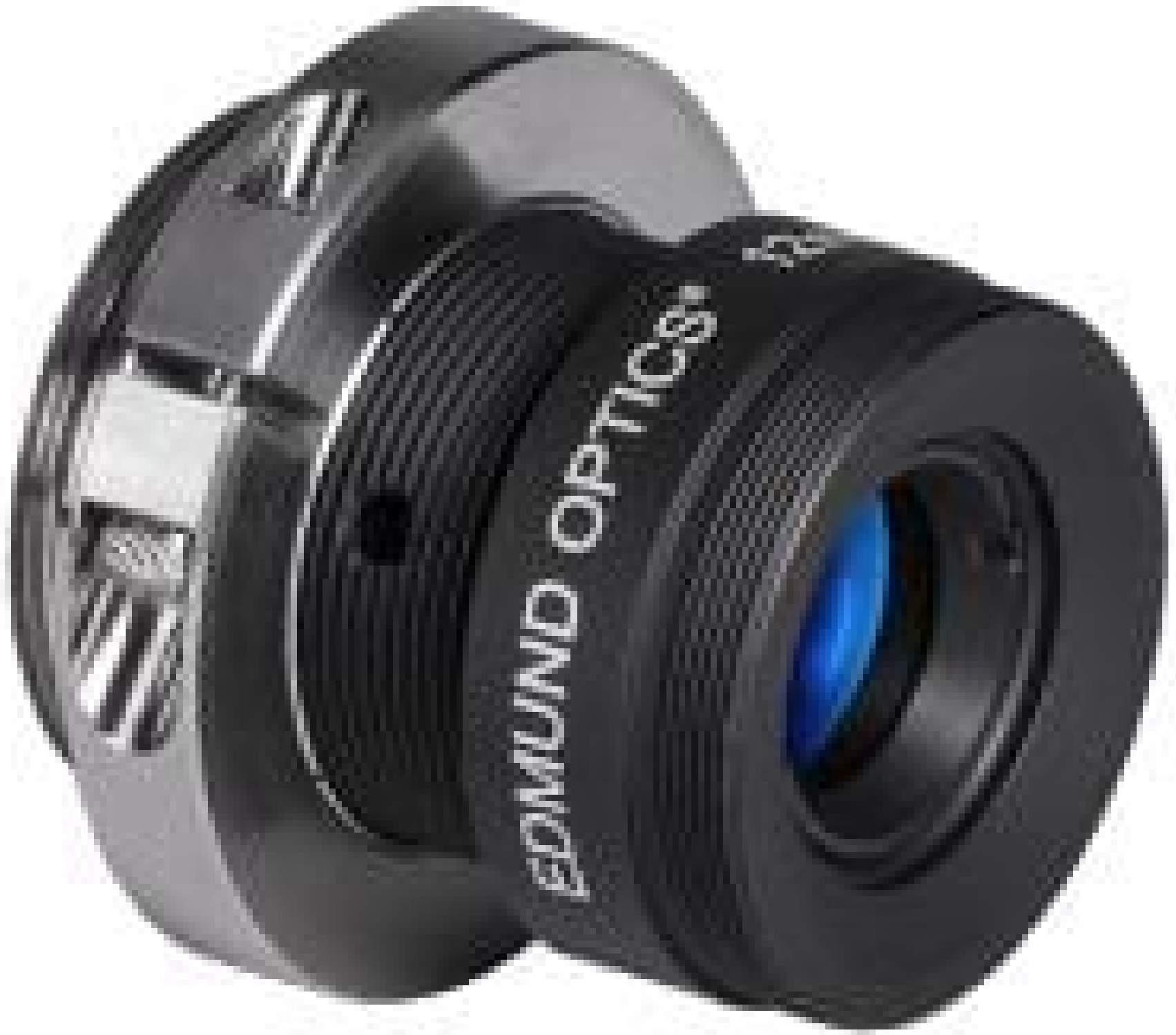
12mm Cr Series Fixed Focal Length Lens