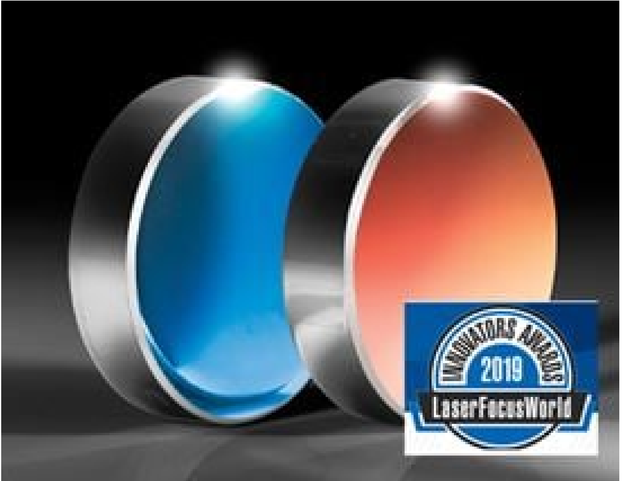
Extreme Ultraviolet (EUV) Flat Mirrors