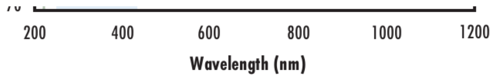
Fused Silica with UV-VIS Coating Typical Transmission