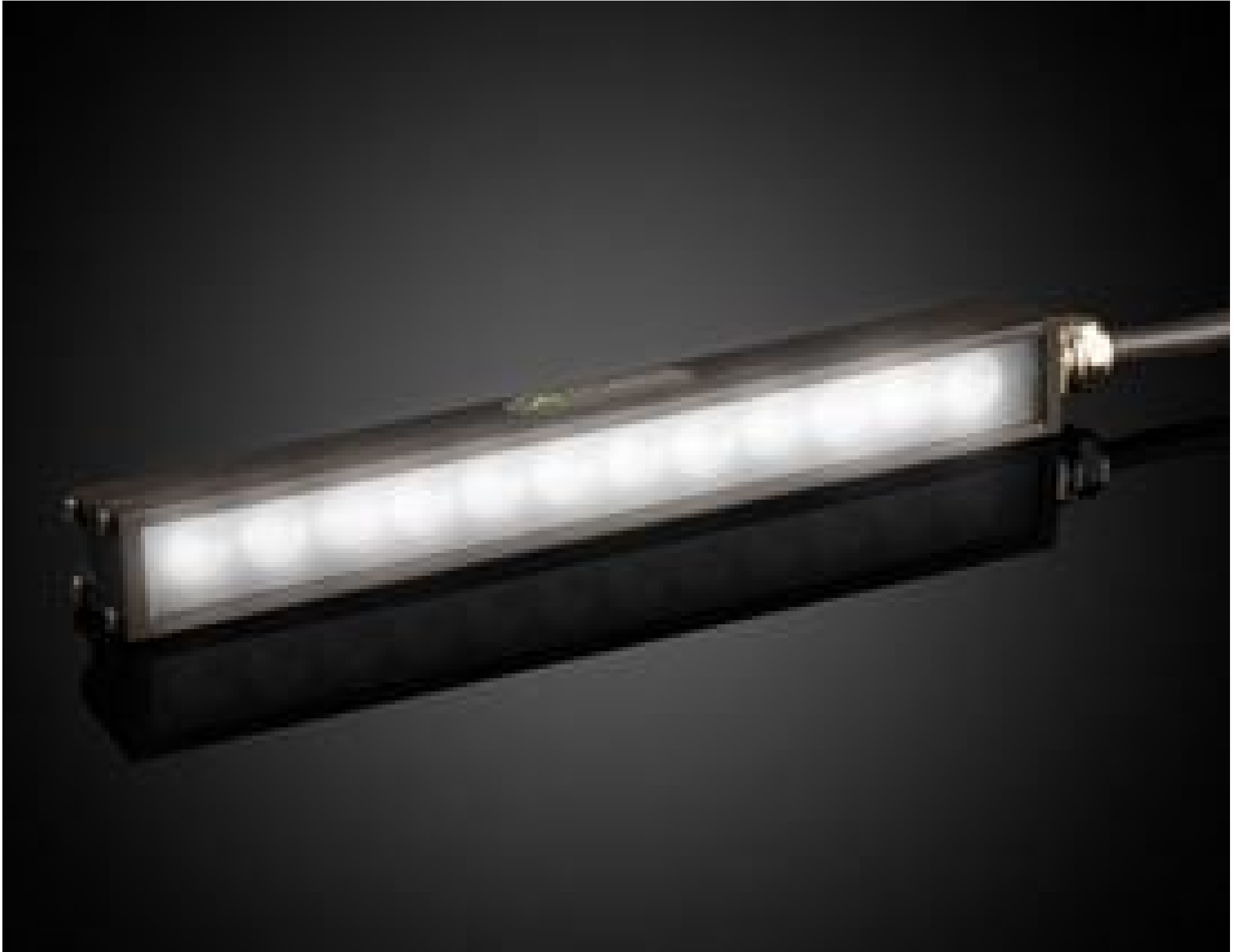
Advanced Illumination MicroBrite Ultra High Intensity Bar Light