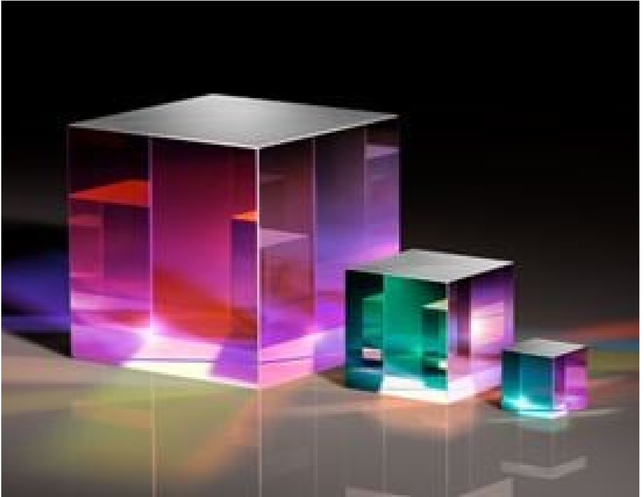
TECHSPEC Laser Line Polarizing Cube Beamsplitters