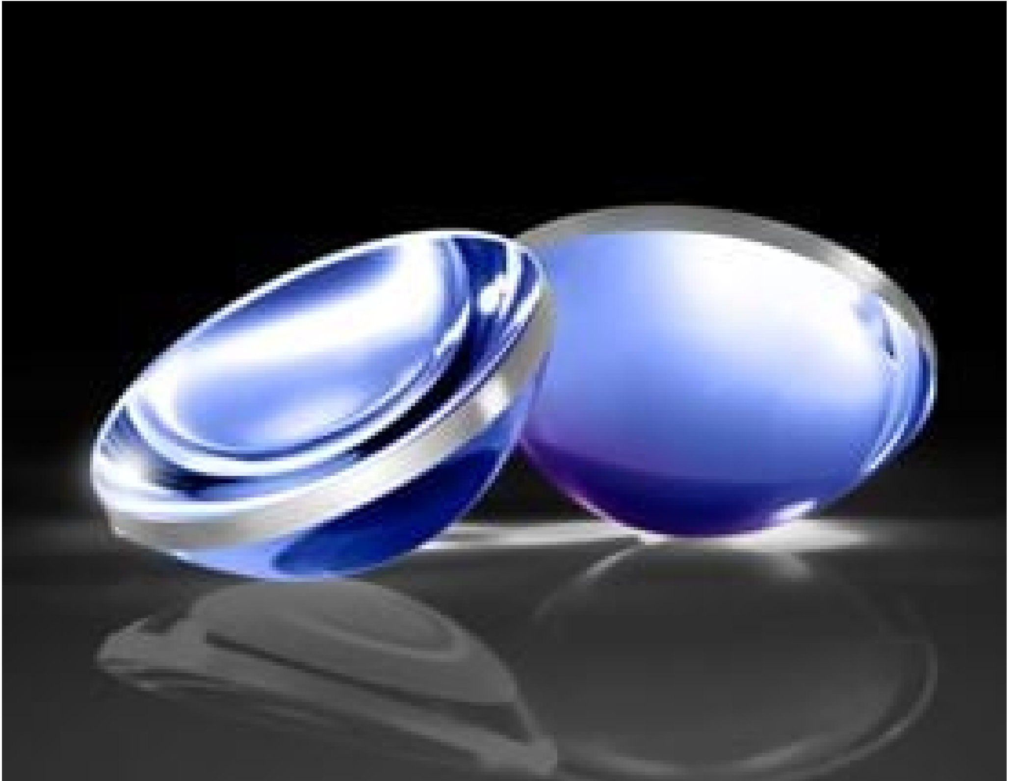
TECHSPEC® Laser Line Coated Aspheric Lenses