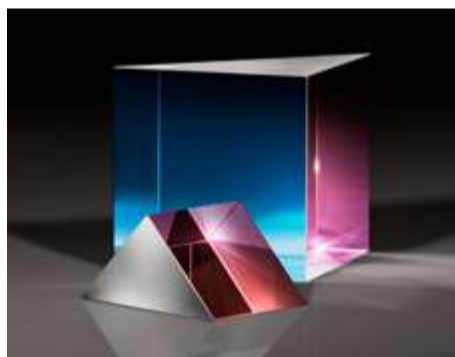
High Tolerance Fused Silica Right Angle Prisms