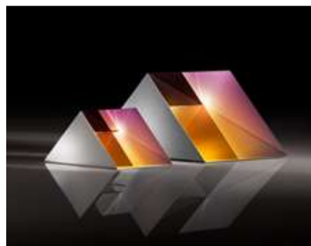
Fused Silica Right Angle Prisms