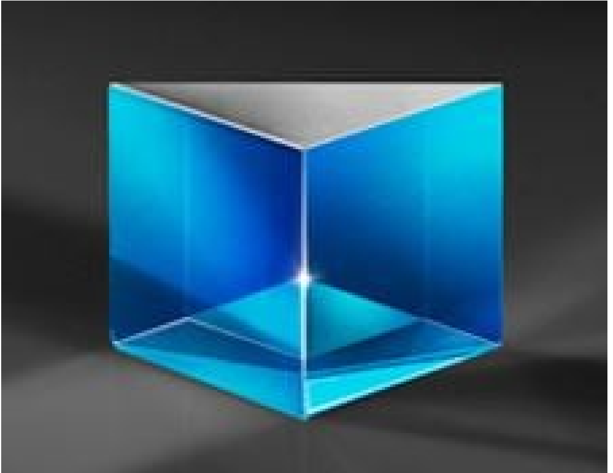
Broadband Anti-Reflection Coated Hypotenuse Prism