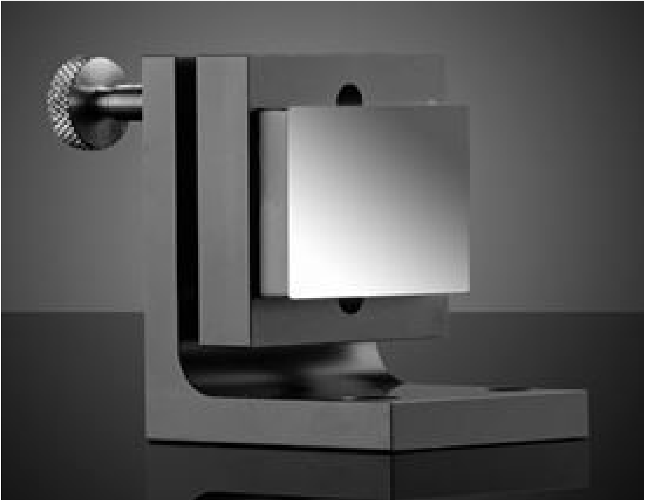
Angle Mount with Mirror