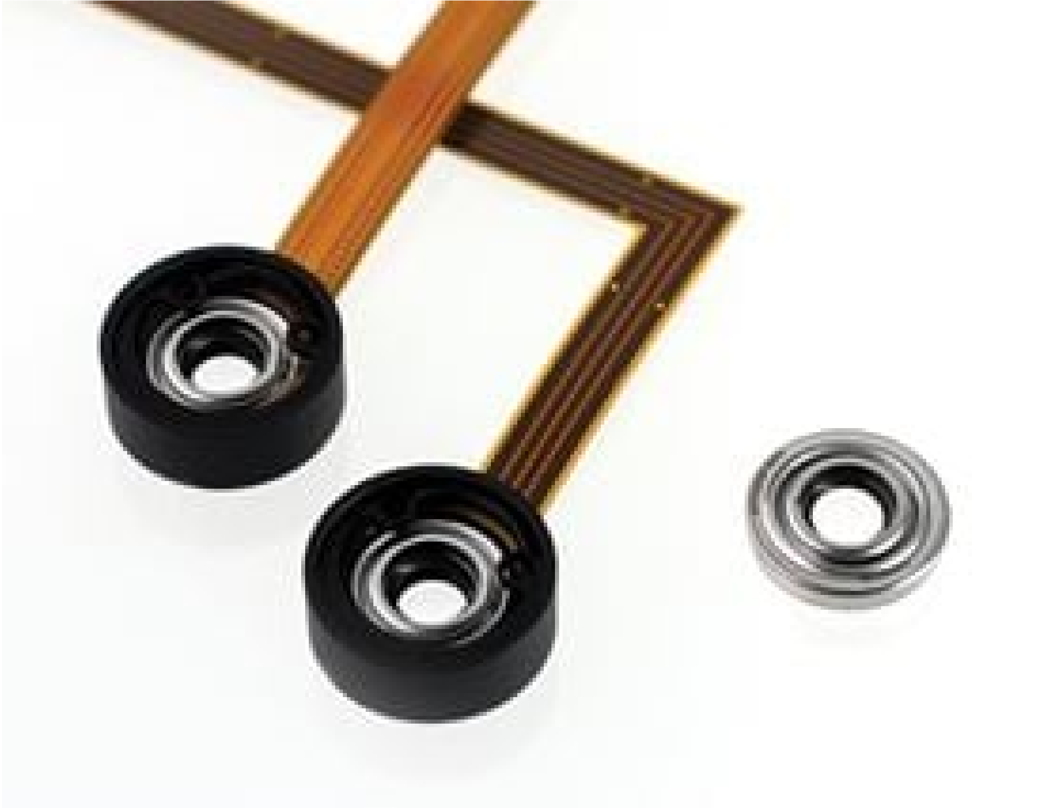
Corning® Varioptic® Variable Focus Liquid Lenses