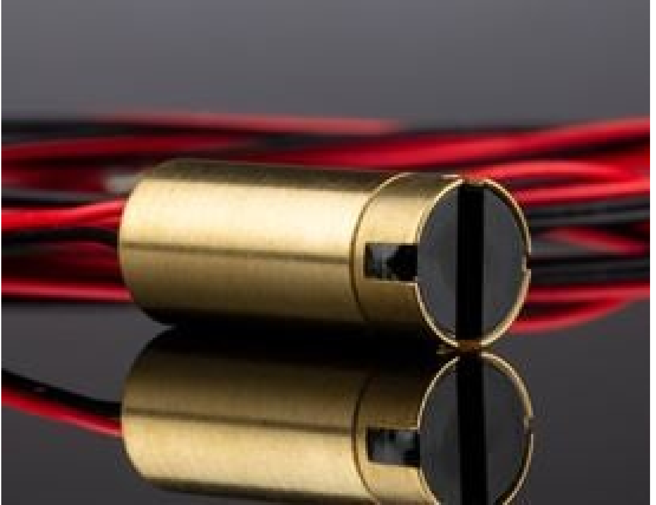
Coherent® Micro VLM™ Laser Diode - Line Option