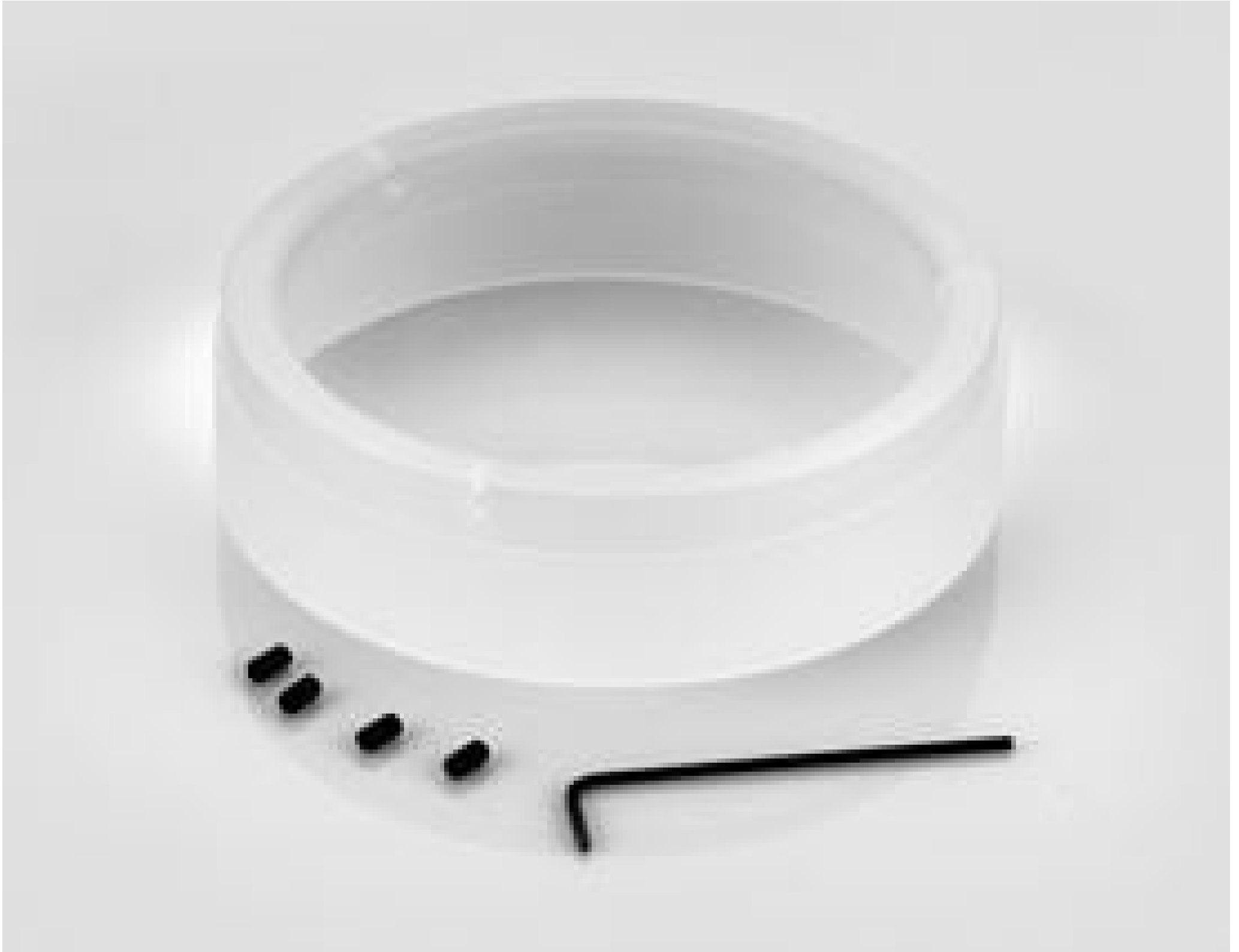
Ring Diffusion Plate