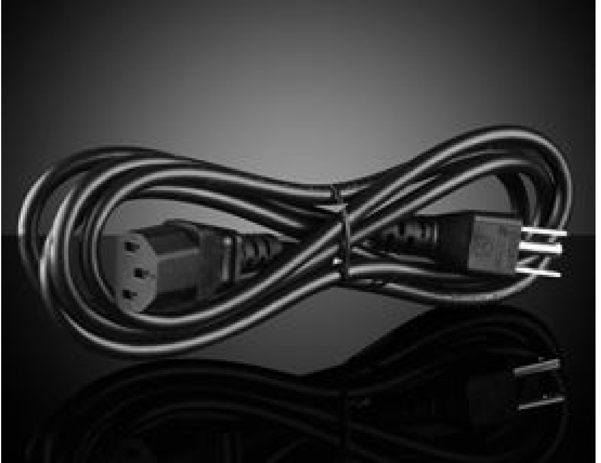
1.8m Power Cord for SCHOTT VisiLED Ring Lights