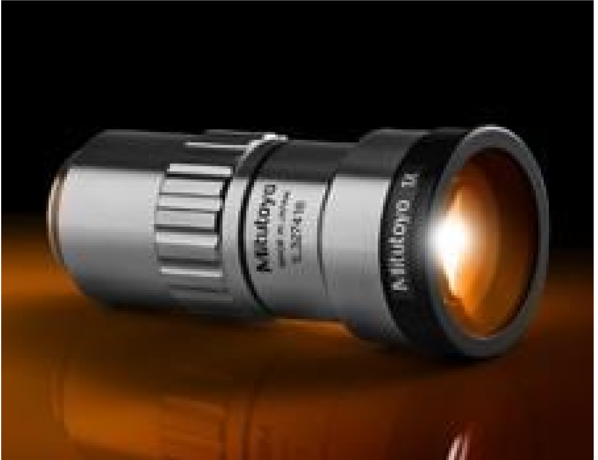
1X Mitutoyo Plan Apo Infinity Corrected Long WD Objective, #58-235