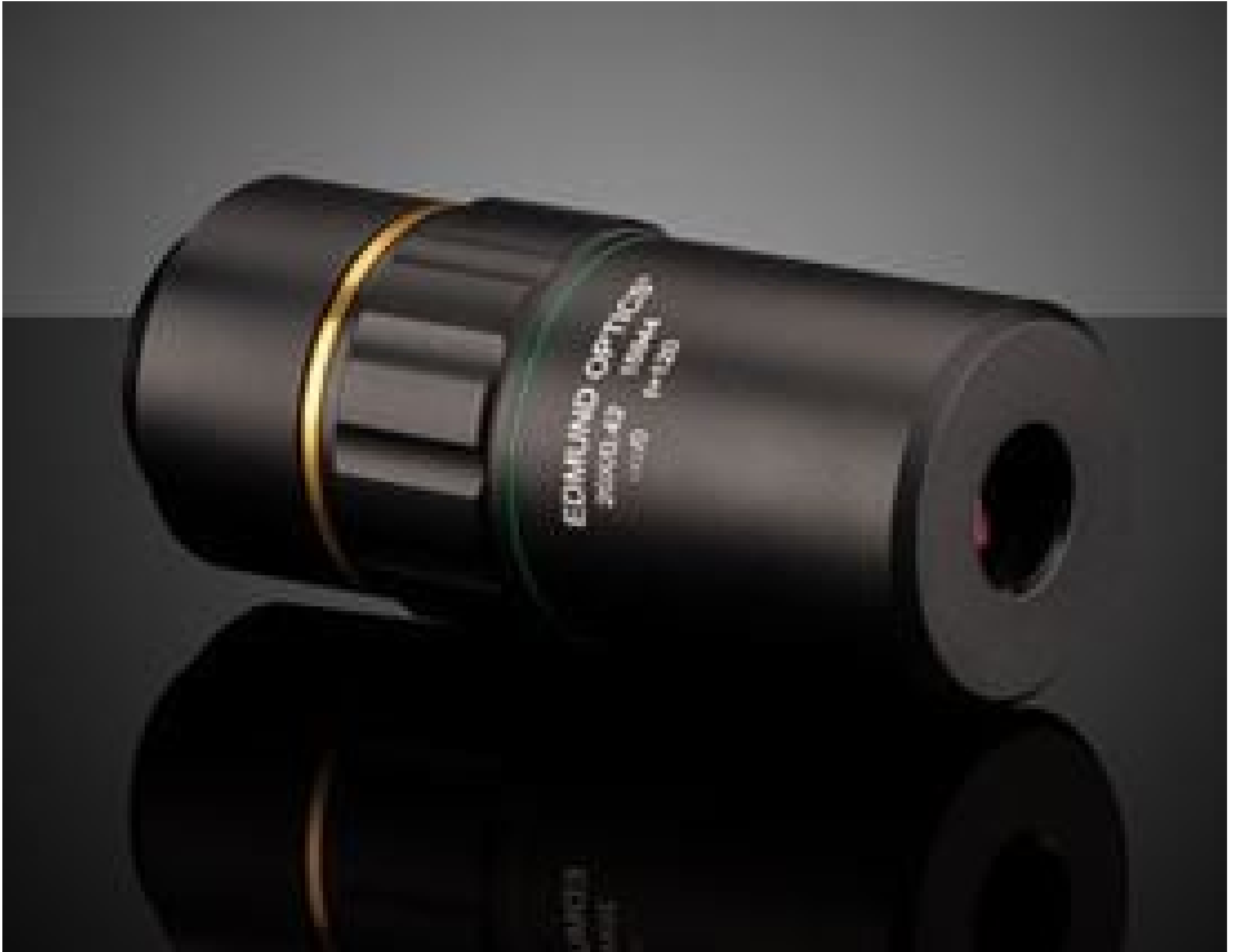
#15-944: 20X 120i Infinity Corrected Objective