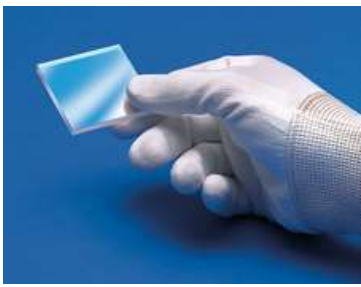
Component Handling Tools