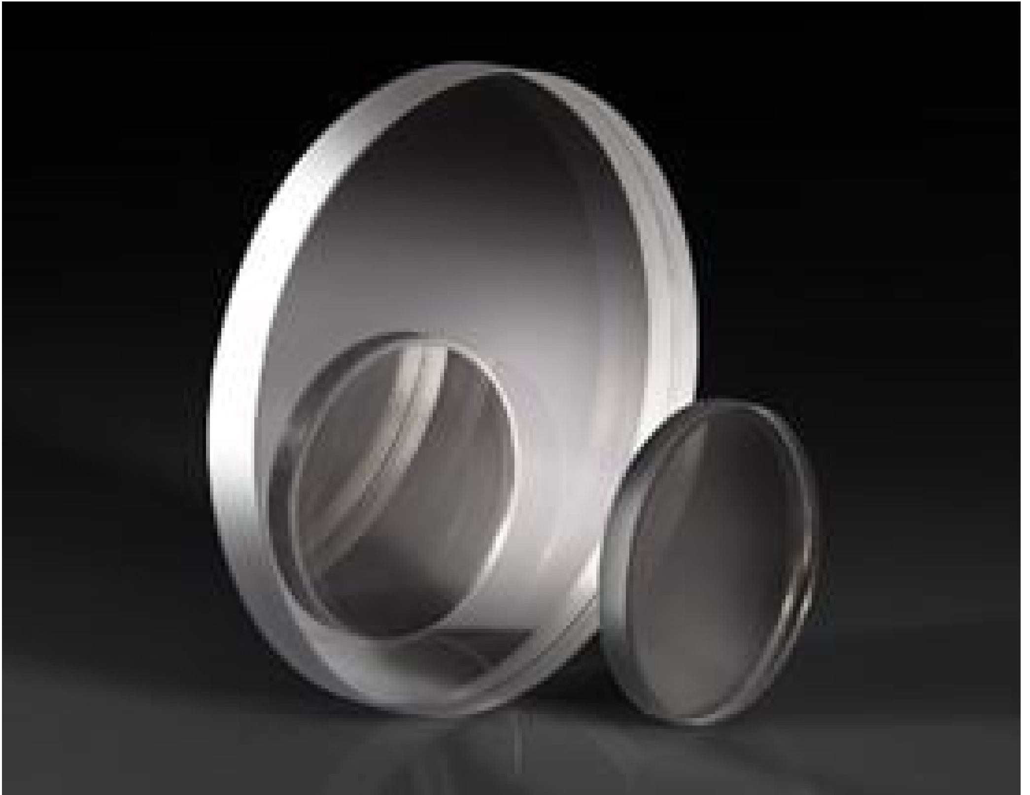
UV-NIR Neutral Density Filters