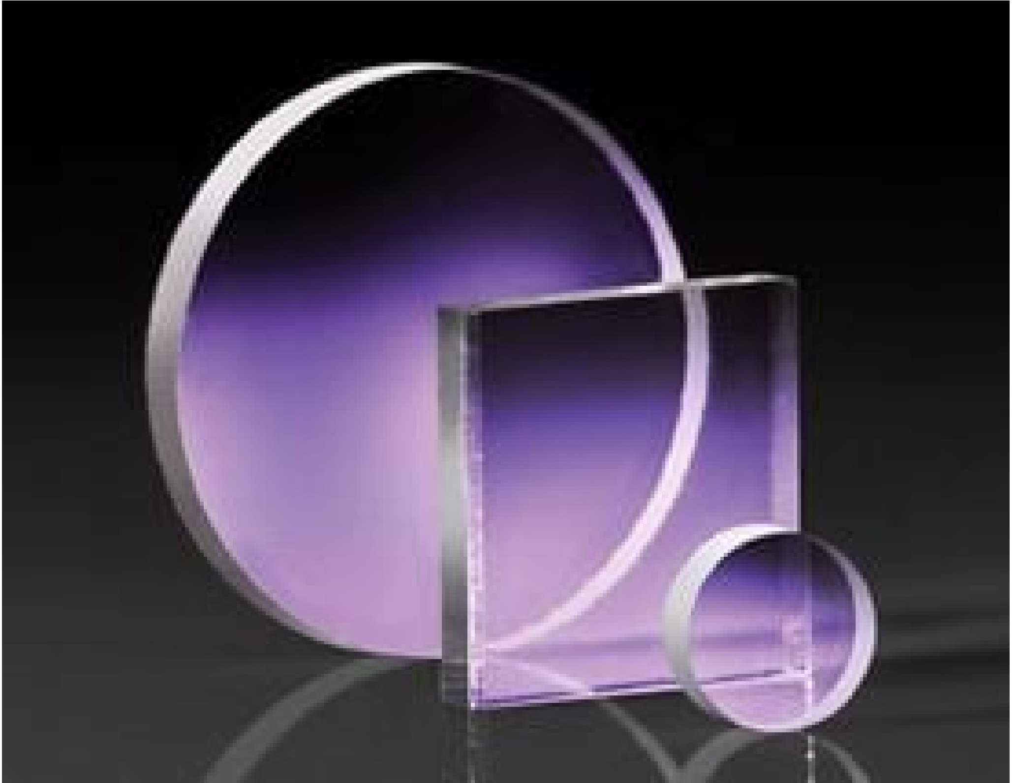
TECHSPEC BOROFLOAT Borosilicate Windows