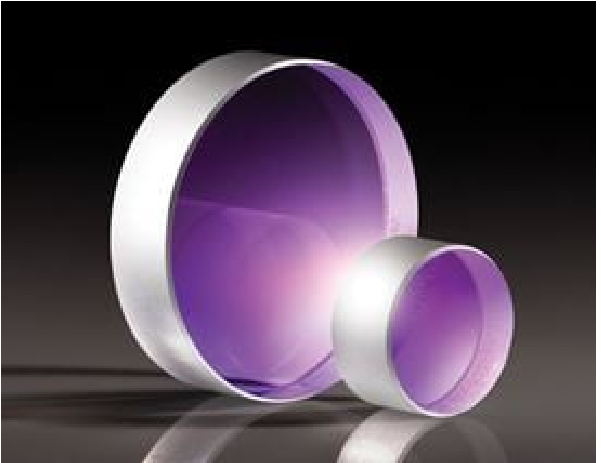
TECHSPEC N/10 Laser Line Coated Windows