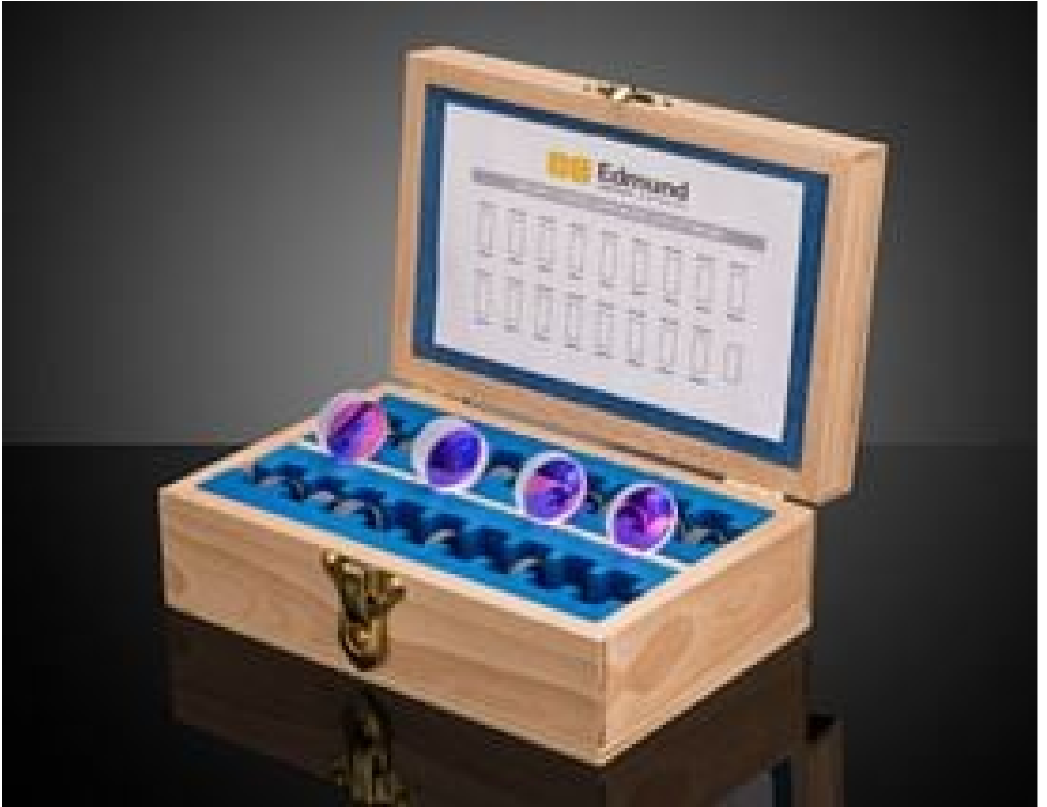
Achromatic Lens Kit