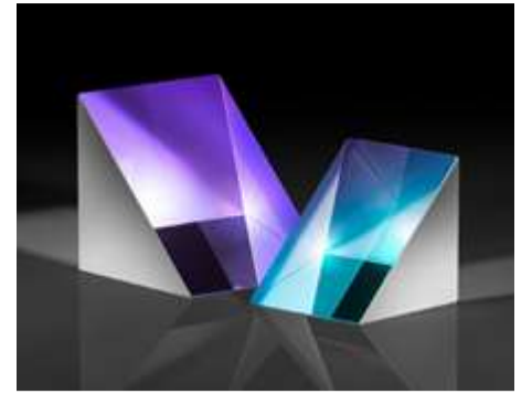
#32-527 - 30mm, Uncoated, N-BK7 Right Angle Prism C$151.20