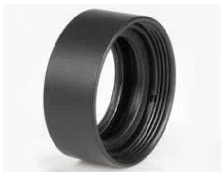
Cage System Optical Lens Mounts