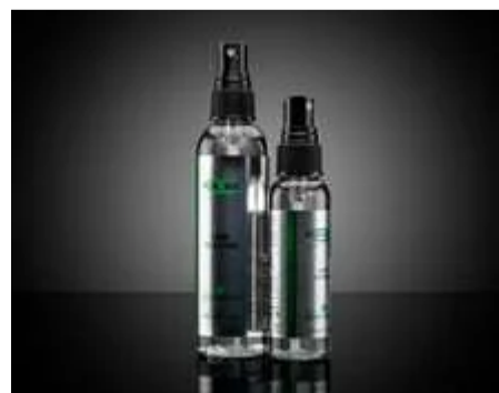
PUROSOL™ Optical Cleaner