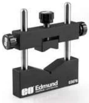
#03-676 - 7.0 - 40.0 Optic Height, English Bar-Type Optic Holder C$148.40