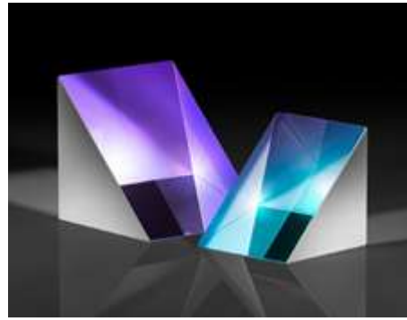
#32-332 - 15mm, Uncoated, N-BK7 Right Angle Prism C$97.30