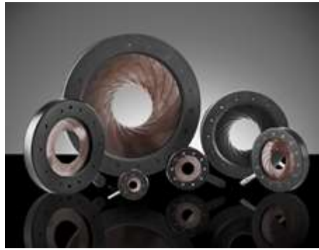
#30-263 - 12mm Max. Aperture, Iris Diaphragm C$68.25