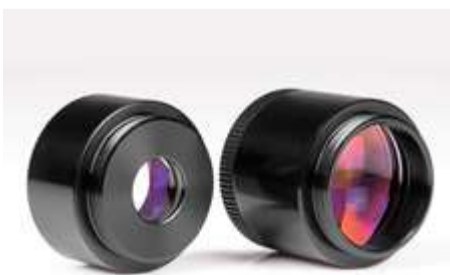
C, S, and T-Mount Circular Optic Mounts