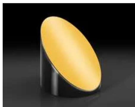
#35-646 - 25.4 x 101.6mm EFL 90° Bare Gold 100Å Off-Axis Parabolic Mirror C$558.60