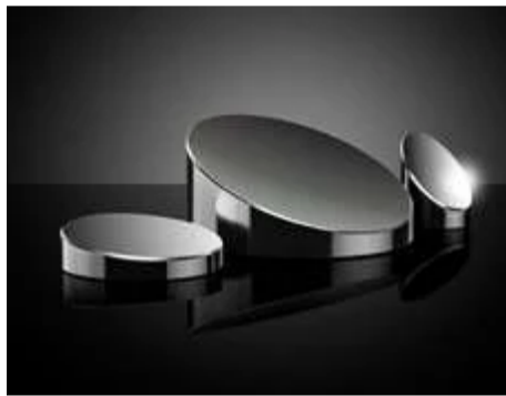
Aluminum Off-Axis Parabolic Mirrors