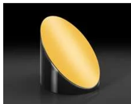
#35-647 - 25.4 x 152.4mm EFL 90° Bare Gold 100Å Off-Axis Parabolic Mirror C$628.60