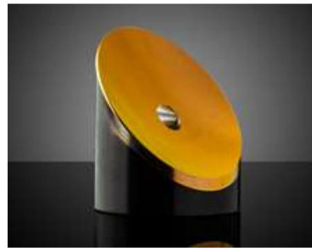
Off-Axis Parabolic Mirrors with Alignment Through Holes