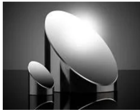
Silver Off-Axis Parabolic Mirrors