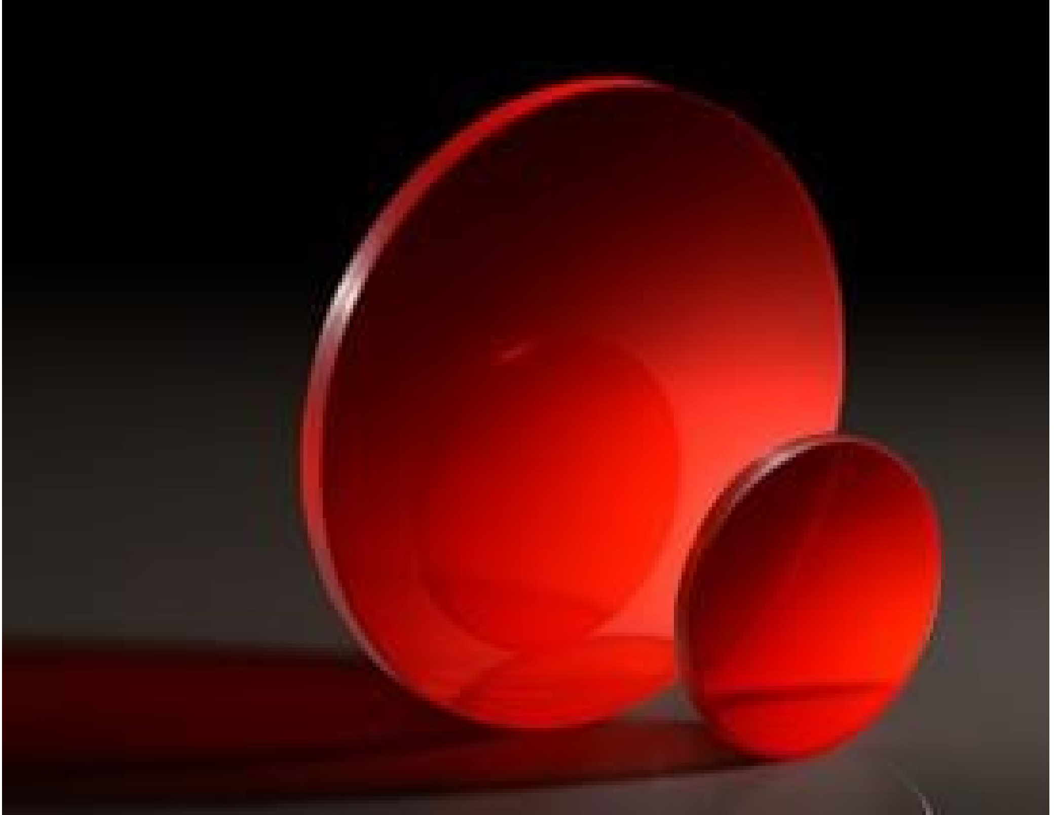
Thallium Bromiodide (KRS-5) Windows