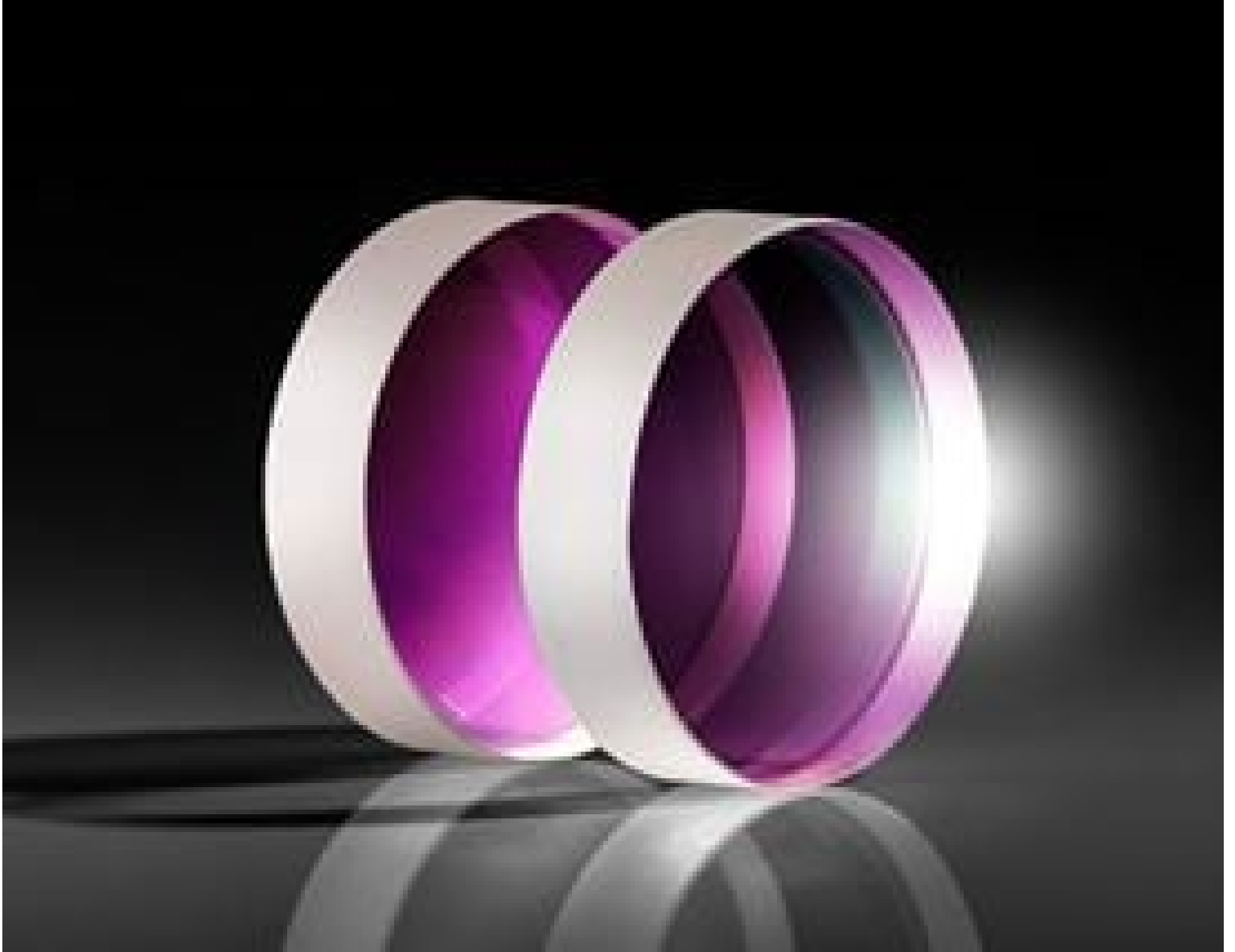
UltraFast Innovations (UFI) Ultra-Broadband Complementary Chirped Mirror Pairs