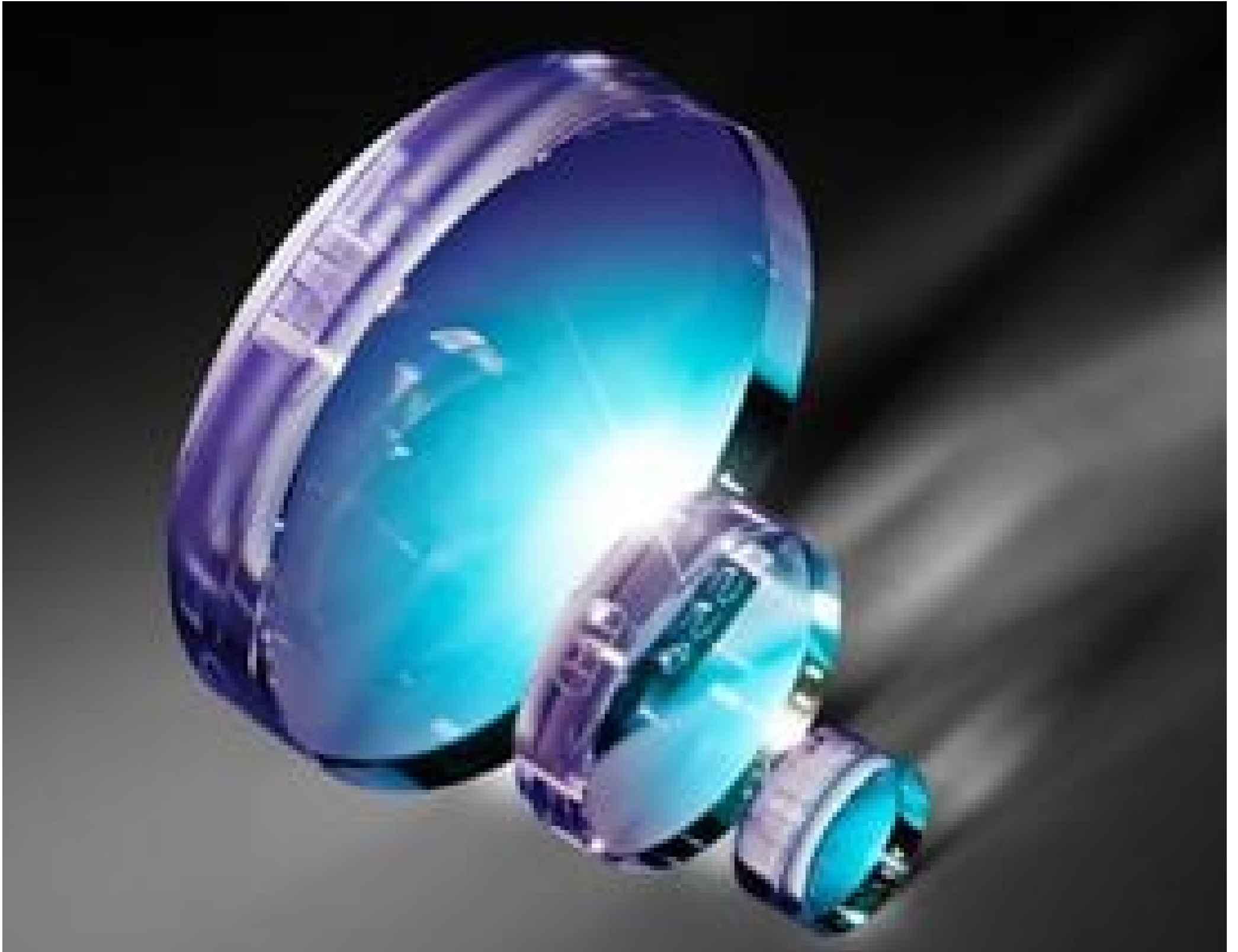
TECHSPEC® Superpolished Substrates