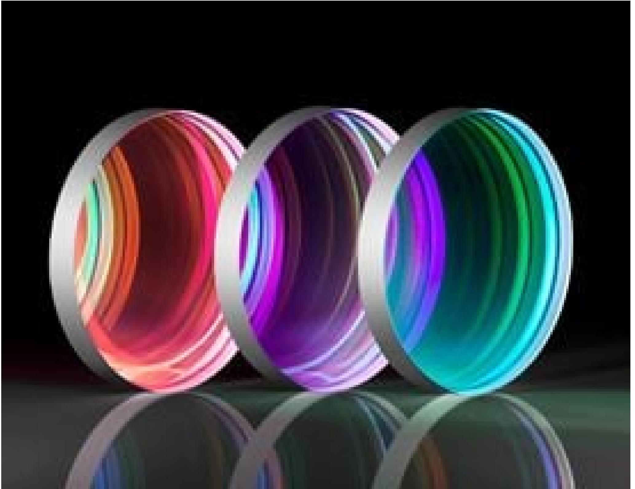
Ultrafast Harmonic Separators